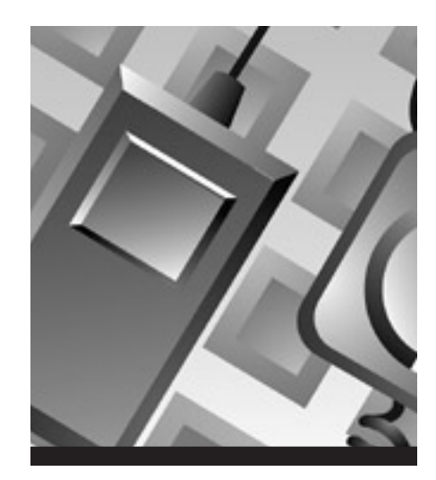
The anonymity of responding with a clicker guarantees near or total participation

Although these systems are becoming increasingly popular in higher education, most research has targeted their affective benefits, which include greater student engagement, increased student interest, and heightened discussion and interactivity. According to West, 6 however, past studies on learning outcomes suggest that better learning outcomes result from changes in pedagogical focus-from passive to active learning—and not from use of a specific technology or technique.